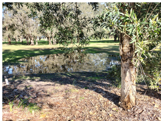
We are definitely spoilt for subject matter at GLAS; recent view from the gallery back door.