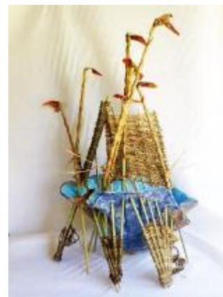
Auntie Norma Drawing; Ceramic Sculpture with Natural Fibres.