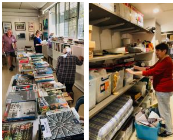
Above left: a team of volunteers sorting our GLAS library books into categories.

They are available for loan at no cost to members - just make sure you write your name and the name of the book in the borrowing book. Please bring them back after a few weeks. I encourage you to have a careful look at what is there - it is amazing and inspiring.