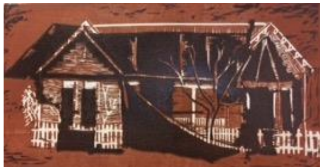
Above: Avalon Then and Now.

I came to GLAS as a volunteer when I retired. I wanted to learn about how to exhibit and refine my artforms. I went to TAFE to 'sharpen my pencil' so to speak. I am a lifelong learner and had done art studies over the years including Bachelor of Education in Visual Arts, but I can always learn more from other creatives. I was invited to take on the Special Needs group on Wednesdays which I did for a couple of years before going back to TAFE to do the Diploma and Advanced Diploma. It is a great local resource that we need to support. GLAS needs everyone to be involved to see it grow and serve the community