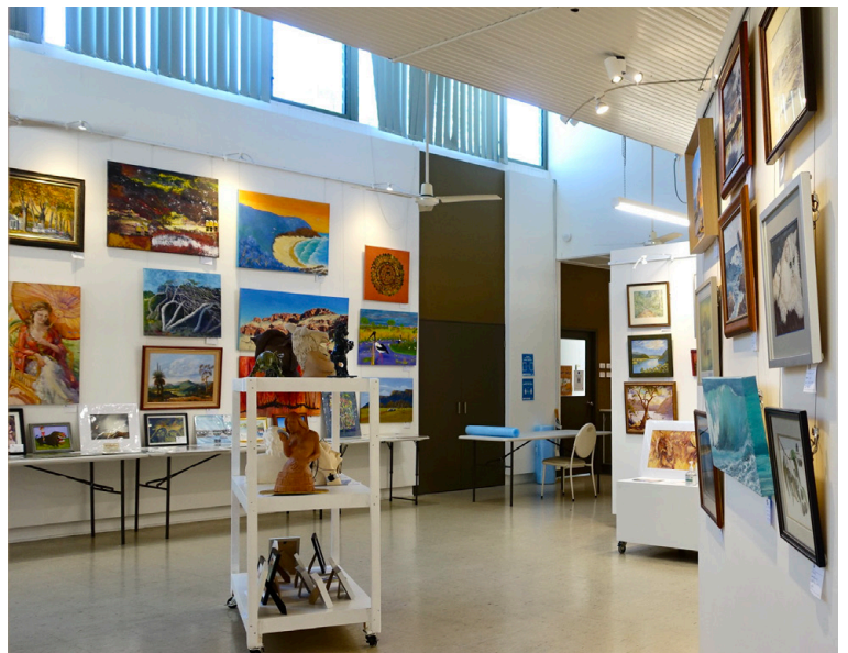
A view of our very successful Behind the Door and Under the Bed Exhibition - just before opening time.